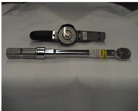
Dial Indicating and Adjustable Wrench

The following are photographs of various torque wrenches MAUSER has found suitable to apply the required closing torque.