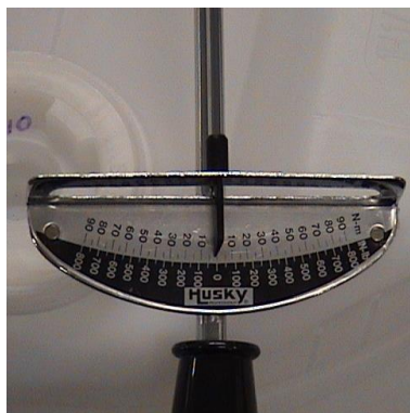
Husky Brand Indicating Wrench