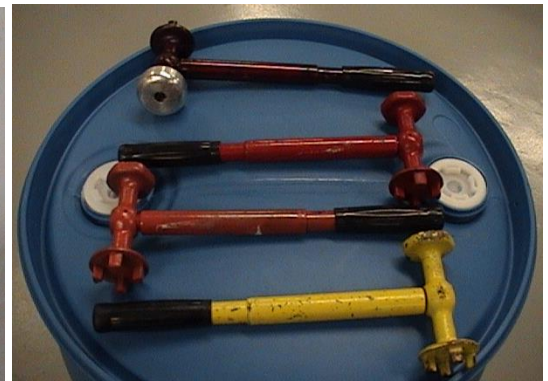
Rieke Brand Preset Wrenches